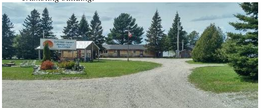
Today the site of the Montreal River CO camp is a tourist lodge on the shore of Lake Superior. The Mennonite Historical Society of Ontario is hoping to recognize this site with a historical plaque.

The Mennonite Historical Society of Ontario is planning to erect a plaque on the highway at Montreal River so people driving by can see where it was. The last wall is crumbling and won't last very much longer. Perhaps you would like to join us next spring (or maybe 2019) for the plaque unveiling! In the meantime, you might like to contribute to this project. Tax-receiptable donations can be made to: Mennonite Historical Society of Ontario, c/o Conrad Grebel University College, 140 Westmount Rd. N., Waterloo, ON N2L 3G6.