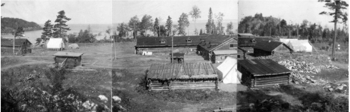
Montreal River Alternative Service camp as it appeared in the 1940s.

The first Alternative Service camp was established in Ontario at Montreal River, at the end of the road north of Sault Ste. Marie. The first COs arrived in July of 1941 and seven groups of men worked there until it closed in 1943. The young men were building the road virtually by hand. After this camp was closed, COs served in agriculture (especially in the Leamington area), fought forest fires and built parks in western Canada.