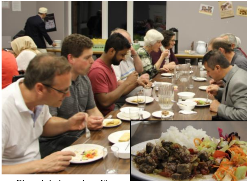
Floradale hosted an Iftar meal on June 1 at 8:00 p.m. This was an opportunity to learn about Ramadan when Muslims fast during daylight hours. The plate at right shows the food served, after sundown.