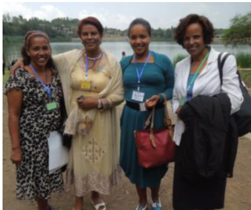
Leaders of the Women's Ministry

To accommodate the large crowd attending the Spiritual Life Conference, the venue was moved to the local