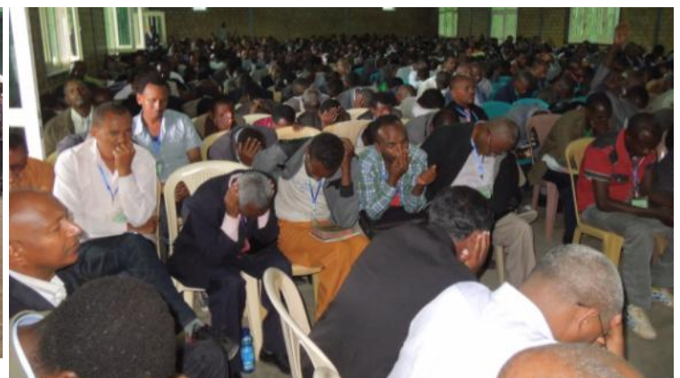
Eight hundred prayers ascending as delegates pray.