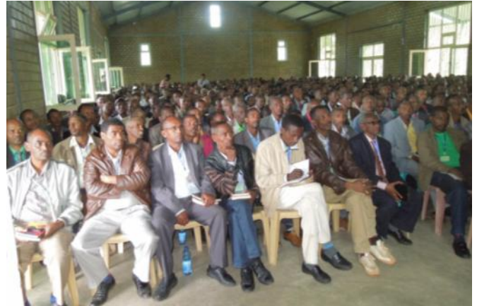
Delegates give rapt attention to the presentations.

(SIM) Retreat Centre complex on the banks of the beautiful volcanic Kuriftu Lake. This meeting was geared toward fellowship, teach-